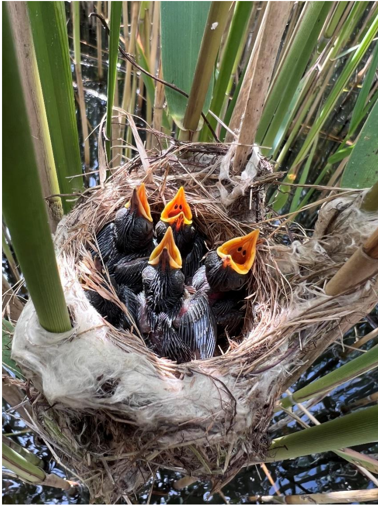
Reed Warbler nest on 14 th Jun