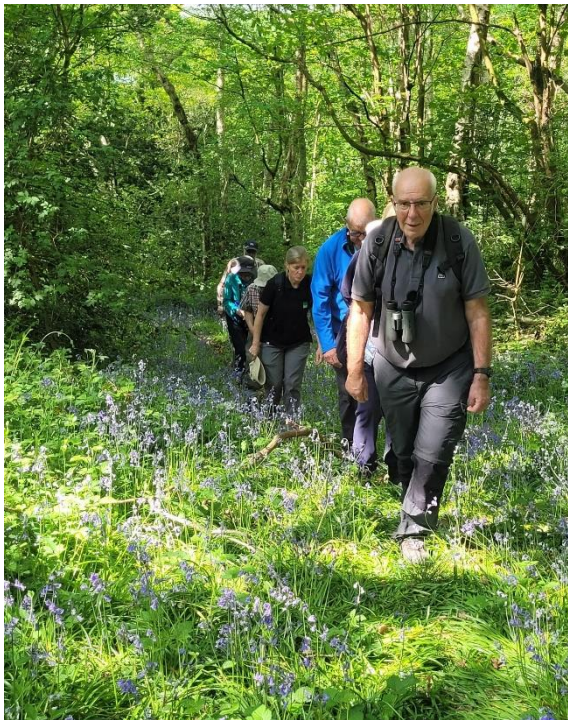
Marple Birding Group visit on 29 th Apr