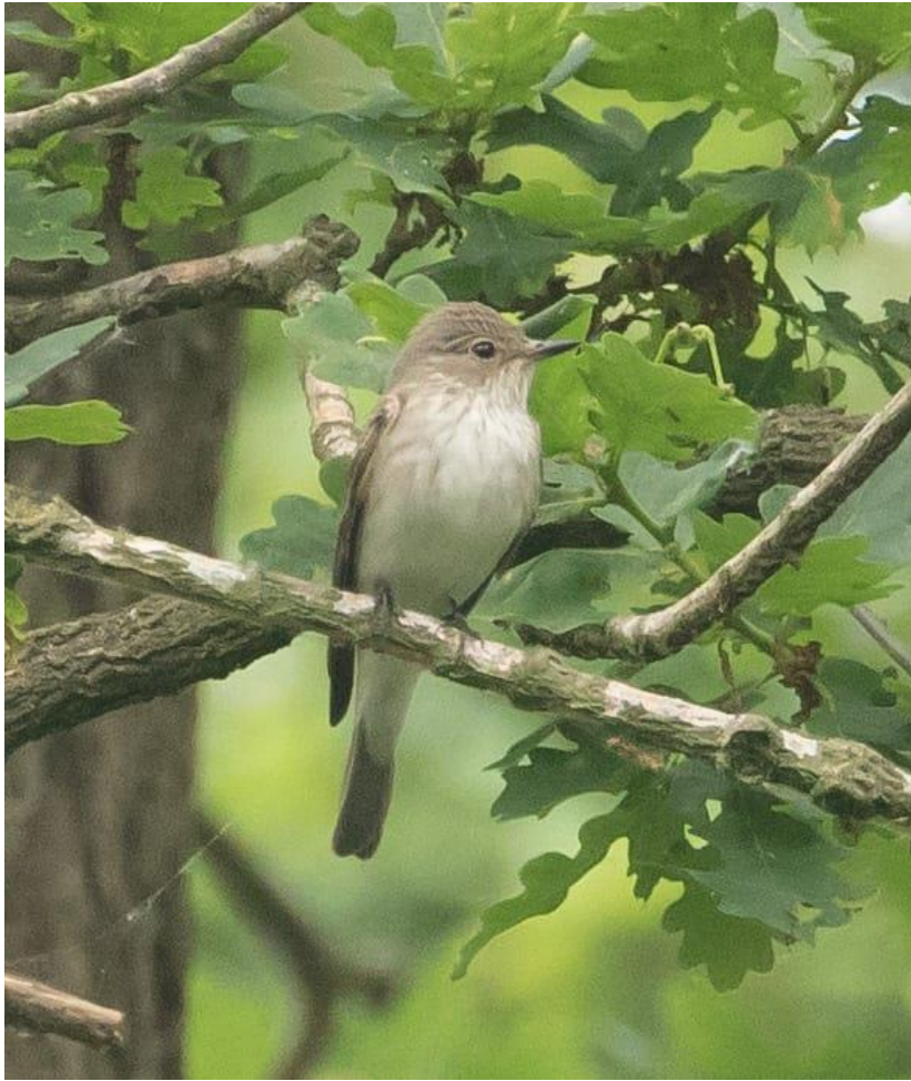
Spotted Flycatcher on 19 th May