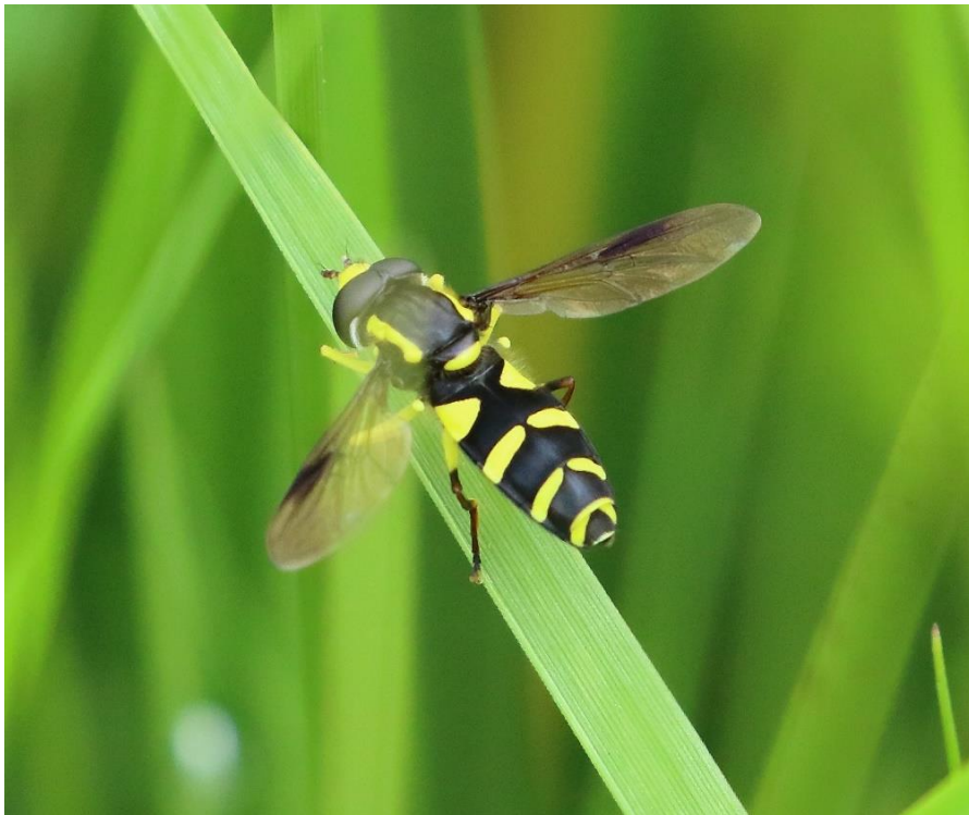
The Superb Ant-hill Hoverfly ( Xanthogramma pedissequum ) on 16 th Jun