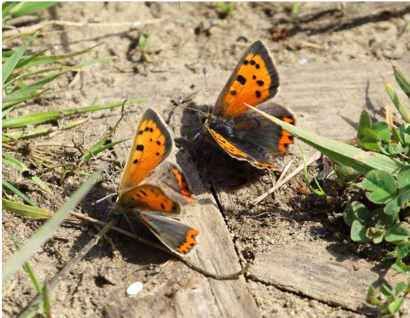
Small Coppers on 27 th Apr