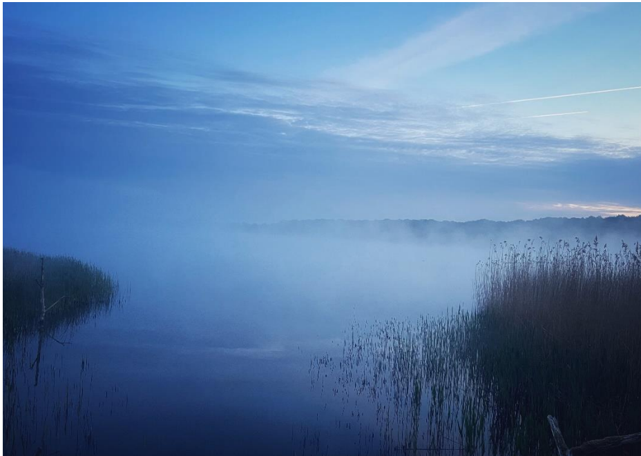
Rostherne Mere on 7 th May