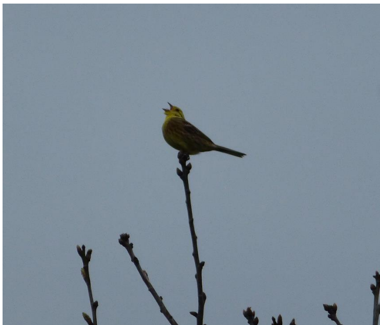
Yellowhammer on 19 th Apr