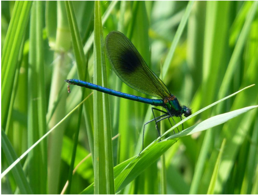
Banded Demoiselle on 7 th May